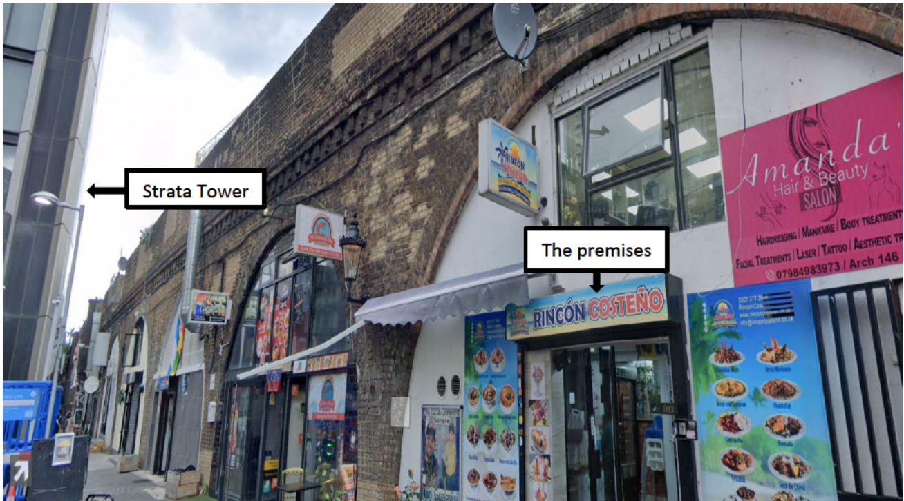
Figure 2: View showing the proximity of Strata Tower and the Crossways United Reformed Church from immediately outside the premises' entrance