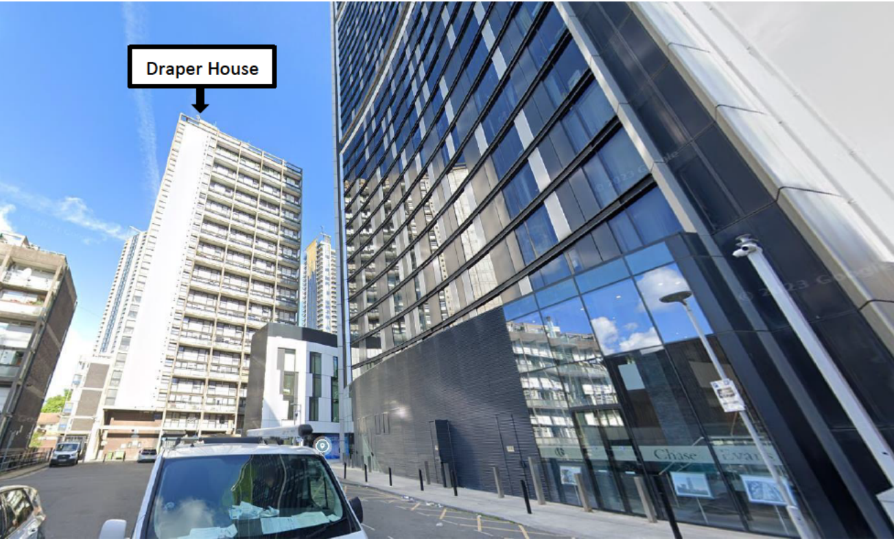
Figure 4: View looking west from outside the premises' entrance showing other residential blocks in close proximity to the building, and further away in the background, UNCLE Tower and One The Elephant Tower